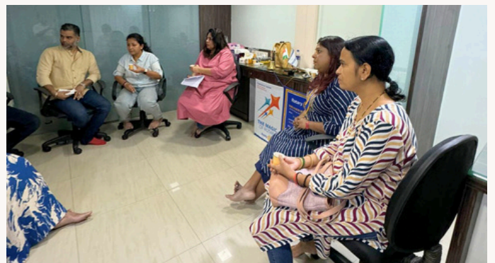
Regular Club meeting on August 7th, 2024