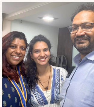
Regular Club meeting on August 21st, 2024