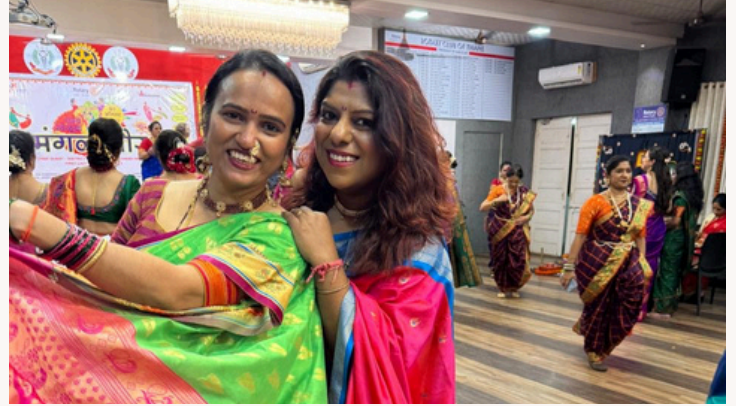
The fabulous women of the Thane Royales Rotary Club!