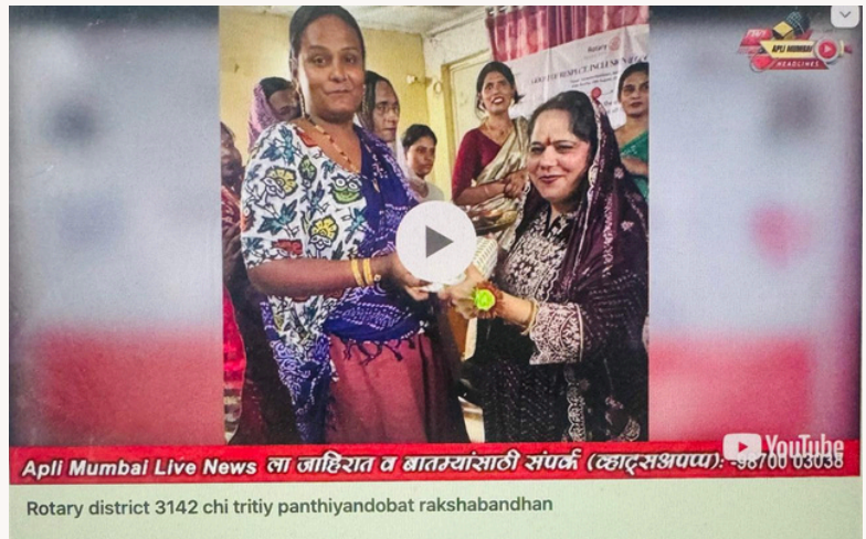
Apil Mumbai Live News ला जाहिरात व बातम्यांसाठी संपर्क (व्हाट्सअप): 99760 03038 Rotary district 3142 chi tritivy panthiyandobab rakshabandhan